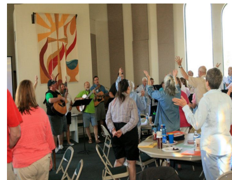
Grande Ultreya June 2008

Questions or comments? Email us at cursillotreasurer@bresnan.net or call 970-256-0155